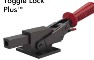
5150-R/5150-MR Flanged Base with DESTACO® Toggle Lock Plus™