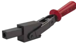
5150-B/5150-MB Solid Base