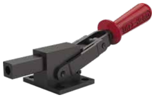
5150/5150-M Flanged Base